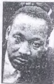
Martin Luther King

Q. Your critics suggest you discount possible conspiracies because you want your books to prove "lone gunman" theories. They say you've got your mind made up before you even begin to write, let alone begin to investigate.